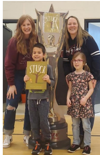
Cougar Reading Madness 2023 Champ– STUCK