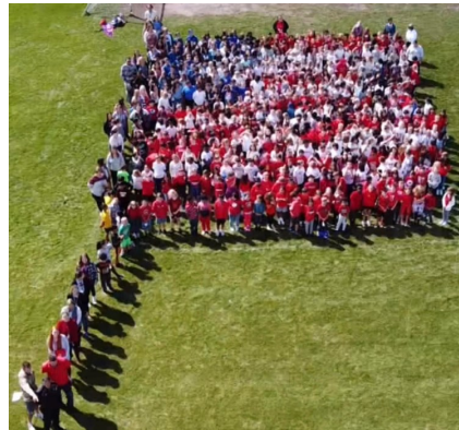
CT Students and Staff– Ariel Mural